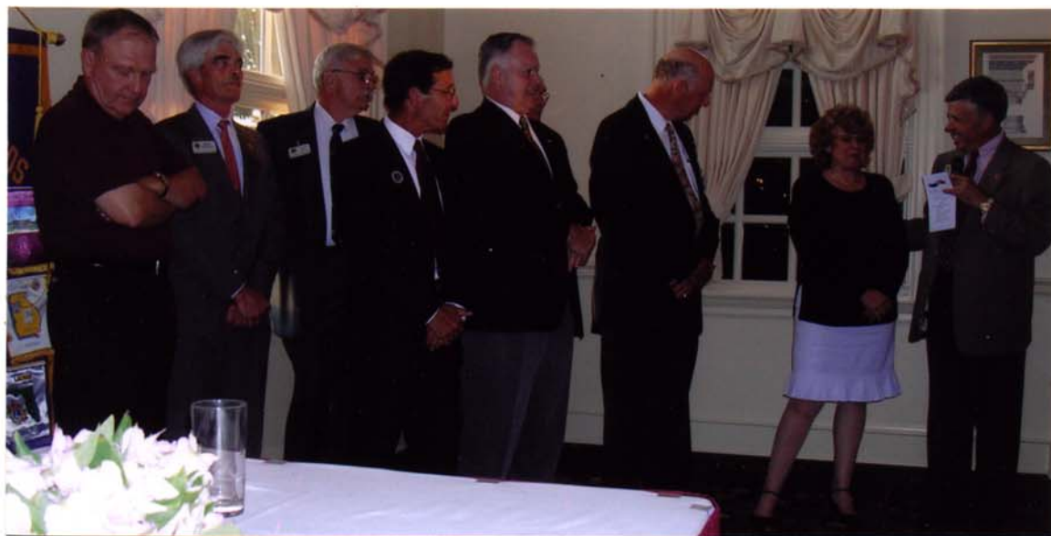
New officers await installation.